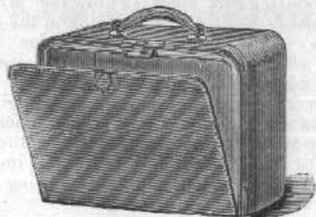
Traveller's Sample Bags

Made throughout in our own Workshops. Highest-class Workmanship. :: Guaranteed Quality. :: Leather Cases and Bags to meet any requirements made to order